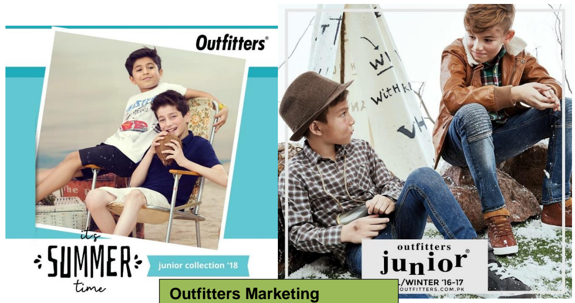
Outfitters Marketing Campaigns