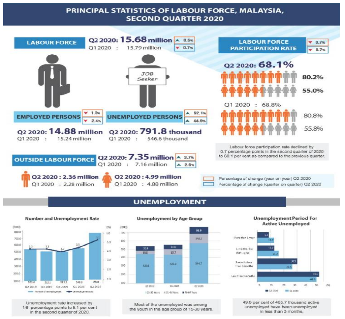
Figure 1: Principal Statistics of Labour Force, Malaysia (Second Quarter, 2020)

(the highest unemployment rate at 6.9%), followed by individuals between 31 and 45 years old (1.4%), and people between 46 and 64 years old (1.1%).