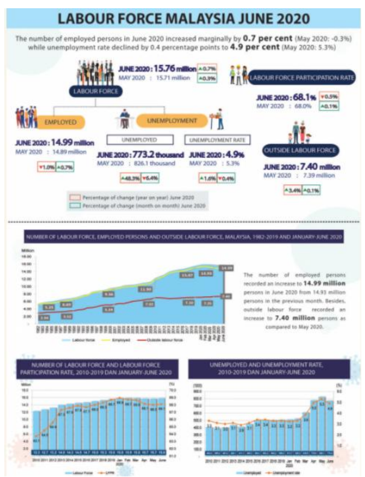
Figure 2: Labour Force Malaysia June 2020