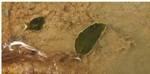
Figure 2: Elysia leucolegnote . Specimens photographed in the field in a footprint and small one showed some damage to the posterior part presumably by a predator.

(Figure 3A-E). All sites were covered by Avicennia marina (Forssk.) Vierh. (3-6 m tree height). Several E. bangtawaensis were observed laying eggs string together on a wood stick and plastic bag (Figure 3G-H).