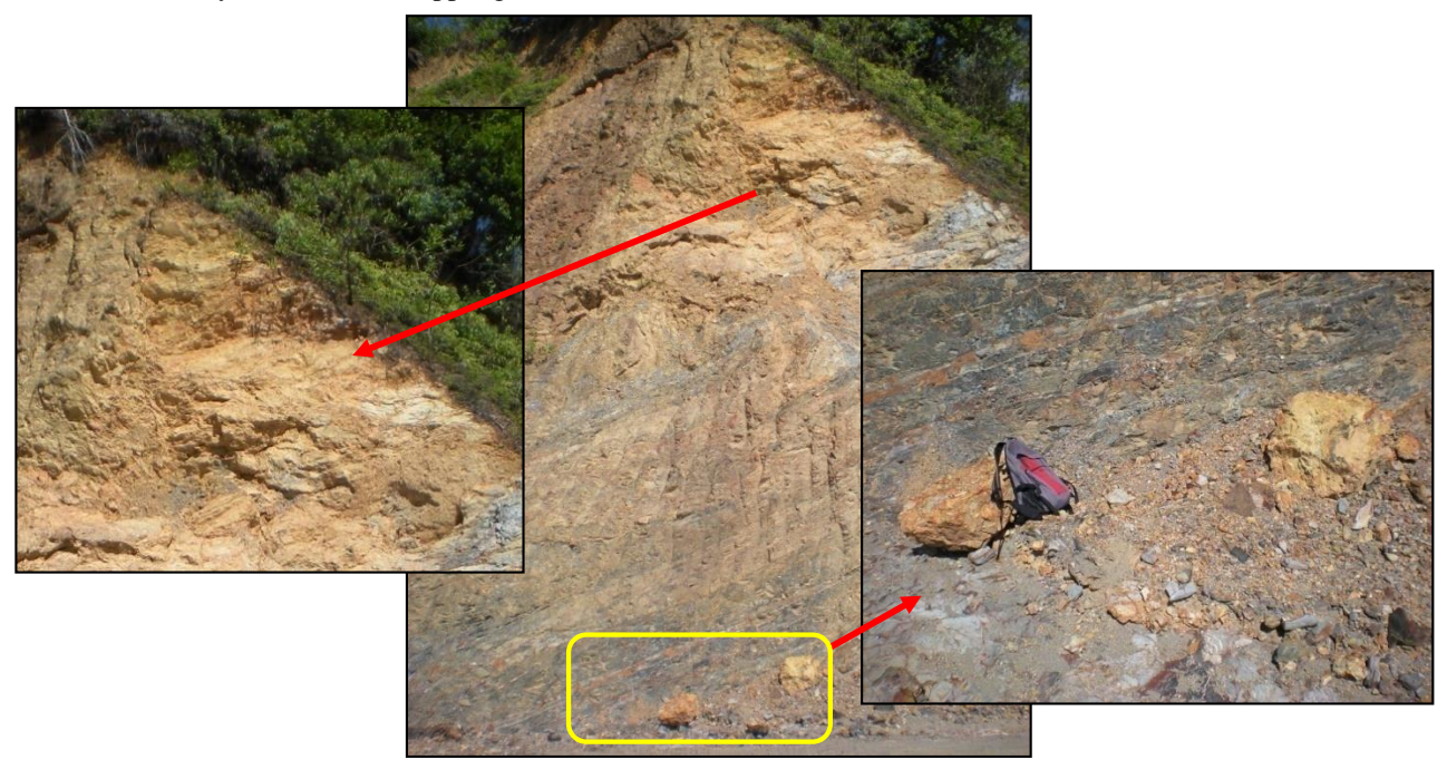
Figure 6 : Rock fall in the form of wedge failure occurred at slope G. Size of blocks that fell is measured 1m x 1m x 0.5m.

occurred on E. Size of failure can be classified medium scale.