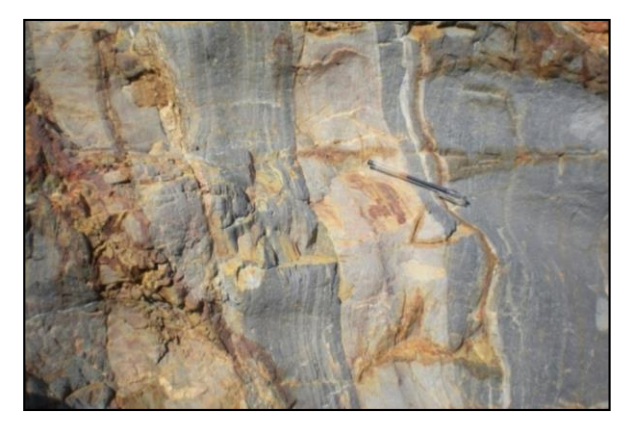
Figure 2: Metamorphosed sedimentary rocks, which can be classified as interbedded metaquartzite, phyllite with minor intercalation of slate.

Geology of the site is essentially consisting of metamorphosed sedimentary rocks, which can be classified as interbedded metaquartzite, phyllite with minor intercalation of slate (Figure 2). The rocks are well foliated and are heavily jointed and in places, sheared. The metaquartzite is generally fine to medium-grained, and is generally light coloured compared to phyllite and slate. Phyllite is generally fine-grained and the weathered surface is generally light yellowish to reddish brown, but light grey on freshly cut surface. Slate is very fine grained, very finely laminated and is commonly black to dark grey.