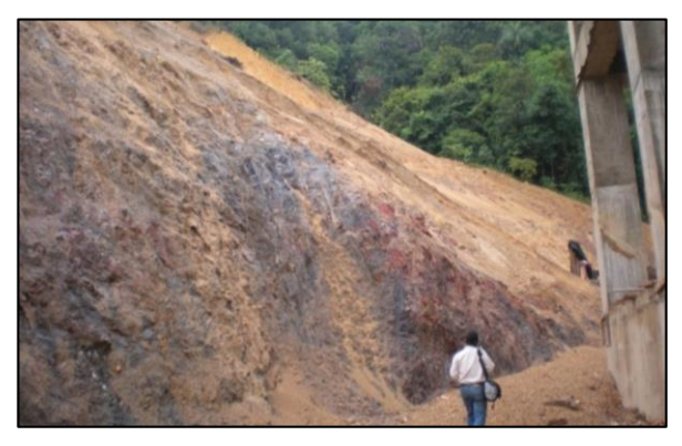
Figure 5: Shallow failure occurred after heavy raining and its involved loose earth material that had dump along slope shoulder.

For the shallow failure, a case of failure was occurred and its size is categorized as medium (Figure 5). This failure is causes by inappropriate earthwork management where earth material is dumping along slope face without proper method. Dumping earthworks waste on the shoulder slope is an unhealthy practice of construction as this will produce a layer of loose soil on the shoulder slope. These wastes can swipe down the slope, especially if there is heavy rainfall in a long period and this may contribute to the occurrence of larger slope failure (Tajul Anuar Jamaluddin, 2010a). For the wedge failure, six slope failure cases are observed and most of failures are causes by slope geometry and discontinuities orientation. Wedge failures can occur when there is an intersection between the two sets of discontinuities and the line of intersection of discontinuity planes is plunged towards the slope face (Hoek & Bray, 1981). The angle of slope face gradient, reaching 60° indirectly increase the probability of failure wedge.