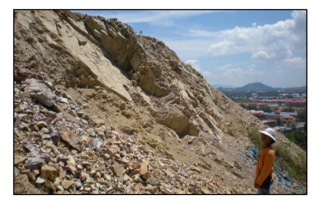
Figure 3: The slope rock mass forming a high density of plane discontinuities due to tectonic action. The rock mass is prone to disintegrate into varies size to the average size of 20cm resulting slope prone to failure.

© 2015 UMK Publisher. All rights reserved.