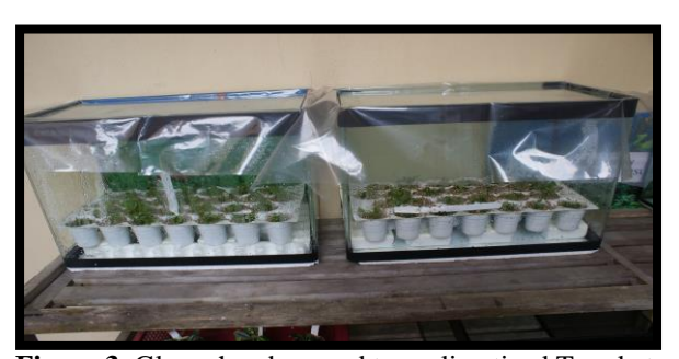
Figure 3 : Glass chamber used to acclimatized Tongkat Ali plantlets