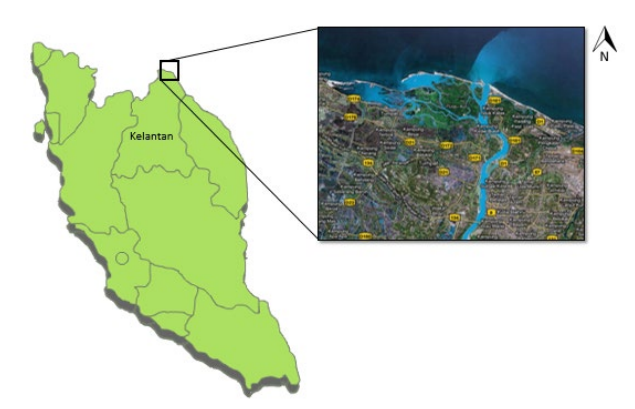
Figure 1. Location of the study area in Delta Tumpat, Kelantan

undisturbed areas were selected randomly. In each site, samples of mollusc were taken five times to avoid bias.