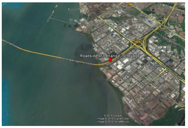
Figure 1 : Sampling location at Penang First Bridge

Penang is an island-state that located between E 100^{\circ} 8' and E 100^{\circ}32' longitude and N 5^{\circ} 8' and N 5^{\circ} 35' latitude in northern region of Peninsular Malaysia that cover approximately 1,030 km<sup>2</sup>. Penang made up by two separate area known as Penang Island and Seberang Perai on the mainland. The sampling location is located at Royal Malaysian Customs Department, Perai (N 5^{\circ} 22' 012'' E 100^{\circ} 23' 589'' ) near the fire station in the Perai industrial area (N 5^{\circ} 23' 4704'' E 100^{\circ} 23' 1977'' ) (NHERI, 2010) as shown in Figure 1.