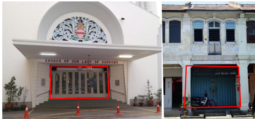
Figure below shows an example from the Church of Lady of Sorrows' (left) & a typical shophouse found in Penang (right), with folding doors at its main entrance.

The Church of Our Lady of Sorrows was meant for Chinese settlers who converted to Catholicism. The Figure 2 (f) is a restored and redesigned version of the church. The front entrance of the church design is what seems like folding wooden door panel with patterned glass panes, depicting that of traditional Chinese shophouses' folding metal doors. The Church of the Holy Name of Jesus, St Paul's Church, the St. George's Anglican Church, and the Shrine of St. Anne have a similarity in the way that the openings of the doorway are in a curvilinear form, which has been mentioned to be expected in traditional Chinese designs. Originally from the design of colonial architecture where some of the building openings are large Roman arches alternated with a series of rectangular Doric pilasters to support the entablature. Together with a touch of traditional Chinese design, the front openings or doorways were framed in curvilinear symmetrical shapes. Some openings are arch designs with sculptured relief on the exterior form of the building, like what was observed in the Church of the Holy Name of Jesus, indicating the integration of the traditional Chinese style with the European style into a unique style of building form.