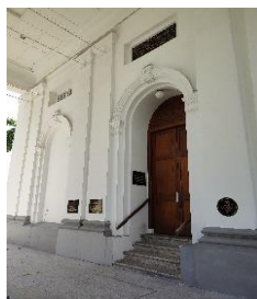
(d) St. George's Anglican Church showing the buildings air vents design