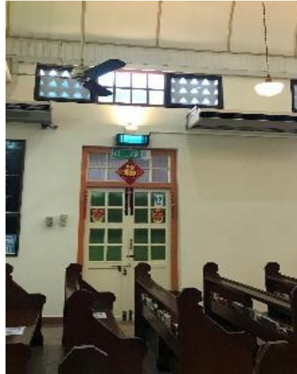
Figure below shows St. Paul's Church (j) interior of the open ventilation.

the St. George's Anglican Church, and the Shrine of St. Anne use the more conventional design of vents with louvered shutters hinged in their vent frames.