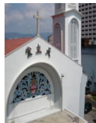
(d) Church of Our Lady of Sorrows