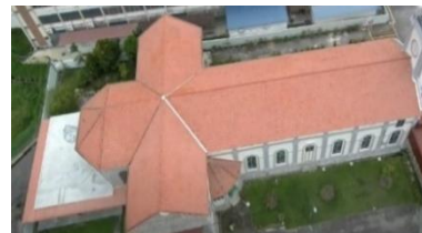
(b) Church of the Holy Name of Jesus