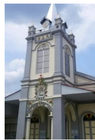
(b) Church of the Holy Name of Jesus showing the design of the building's openings & windows