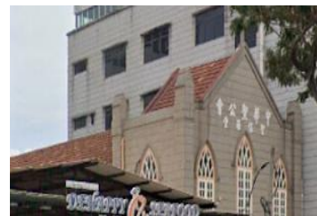
(e) St. Paul's Church