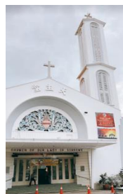
(a) Church of Our Lady of Sorrows showing the design of the building's openings & windows

The traditional Chinese architecture in Malaysia has a distinctive form to its building form, as the design of the openings, air vents, and windows play a part in the overall form of a building. Usually, buildings of the traditional Chinese influence have a double door opening at the doorway with carvings and motifs - each with its own meaning - usually can be found at the front opening of the buildings. Windows in traditional Chinese architecture, however, are in curvilinear symmetrical forms. A traditional Chinese house has air vents usually located at the upper part of a building façade; some are designed with decorative holes. Similarly, with the design of its windows, some are seen to use the most conventional type, the vents with louvered shutters.