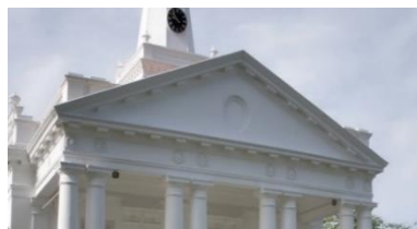
(a) St. George's Anglican Church