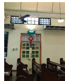
(e) St. Paul's Church showing the building's air vents design