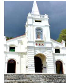
(c) Shrine of St. Anne showing the design of the building's openings & windows