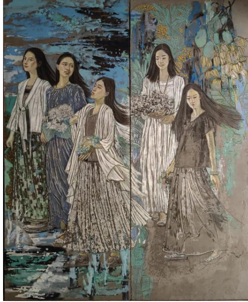
Figure 7. Liu Chunxia, "Southern Smoke Breeze", 240x200cm, mineral pigment on clay on wood, 2022