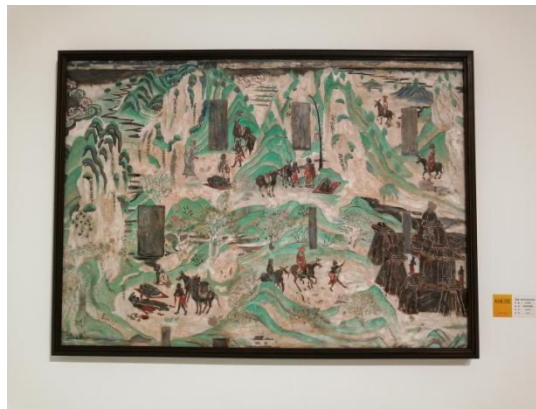
Figure 6. Reproduction of Liu Chunxia, Landscape Painting of the Fahua Sutra Changes in Dunhuang Cave 217, 160x100cm, mineral pigment on wood panel with clay base 2018

The author carries out in-depth research on the medium, material and operation steps of traditional Chinese mural paintings through the method of literature combing and the method of literature summarizing and distributing, and then carries out the practical application of the ground battle production and color application of the mixed-material paintings and analyzes the material aesthetics of the mixed-material paintings and the analysis of the paintings' performance. The following are some of the mixed-material paintings created by the author: Figure 6 is a copy of the landscape of the Fahua Sutra in Cave 217 of Dunhuang, which restores the steps and techniques of traditional Chinese fresco painting, making the clay ground battles in person and applying natural mineral pigments to color the picture. In the process of painting, we tried our best to restore the charm of the frescoes and at the same time further deepen our understanding of traditional Chinese frescoes.