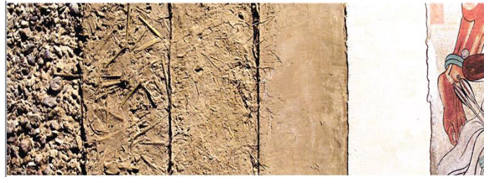
Figure 1: Multi-layered ground battle layers in traditional Chinese mural paintings

fresco ground battles focuses on the materials, formulas, methods and steps of multi-layer ground battles treatment in the traditional architectural environment, especially the fresco painting technique of using mineral colors on top of the same ground battles base as the ancient frescoes, to express the fresco painting techniques and effects inherited from the ancient times. These production techniques and artistic effects can be applied to the creation of contemporary mixed-material paintings.