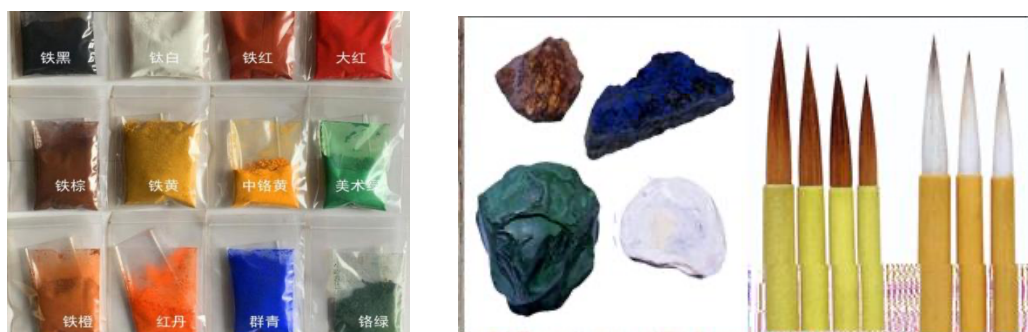
Figure 5. Natural substance pigments and brushes

In the creation of the natural mineral pigment and ink color modulation, its purpose is to highlight the color contrast, saturation lower brightness darker, so as to bring out the picture atmosphere of solemnity and solemnity. Meanwhile, in the eighteenth and nineteenth centuries, when the chemical process was backward, most of the pigments used in paintings were taken from natural substances, such as cinnabar, malachite, lapis lazuli and so on. Thousands of years of human civilization have proved that these stone colors are not only colorful but also stable, not easy to change color, and are high-quality mineral pigments, as shown in Figure 5.