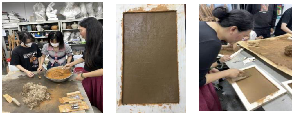
Figure 4. Ground Battle Material and Fabrication Diagram

The ground material of traditional Chinese mural paintings usually refers to the foundation ground of the mural works, which is used to support and carry the painting pigments. These flooring materials vary according to the time, place and technology, but common flooring materials include: plaster, lime, silk, wood, paper, and so on. The choice of these materials depends on the artist's intent, the scale and context of the mural work, and the specific technical requirements needed. At the same time, the choice and use of ground materials has evolved and improved over time and with technological advances.