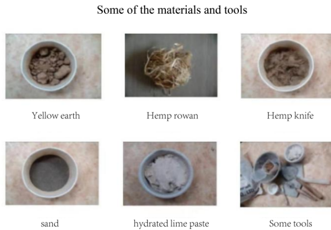
Figure 3. Some of the materials and tools used in the production of traditional Chinese murals

Traditional Chinese murals use a variety of materials to create their work. Some of the main materials include sackcloth, loess, wheat straw, straw, rowan, hemp knives, papier-mâché, cotton, sand, slaked lime paste, spatulas, mud spatulas, gelatin, and alum.