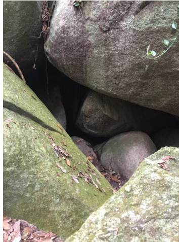
Figure 7: Entrance to the Cave of Puteri Saadong

Water is also essential in the daily life of a Muslim. One of the preconditions for the acceptance of the five daily prayers is cleanliness. Therefore, the believers must perform ablution (with water) before praying. A child is considered pure and without sins, thus it is probably no coincidence that the child Puteri Saadong is connected to the pure element of water. Other famous geological formations are related to events that took place after Puteri Saadong returned from Siam and after she stabbed her husband. She fled into the forest of Bukit Marak and lived there with her followers. One important geological place is the cave at the top of the hill (see Plate 7).