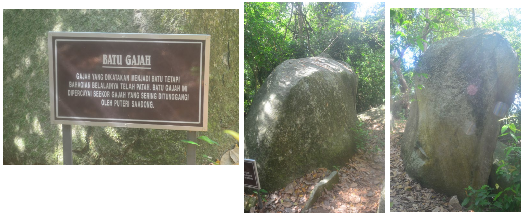
Figure 13: Elephant-Shaped Stone in Bukit Marak

In Bukit Marak, a former cave was also found, which is believed to have been the residence of Puteri Saadong while she was in Bukit Marak. In ancient times, this place was believed to be where the community around Bukit Marak contacted or sought help from Puteri Saadong.