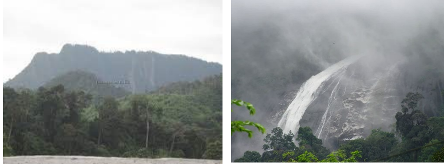
Figure 4: Gunung Ayam (a mountain in the interior of Kelantan).

Gunung Ayam, formerly known as Gunung Chinta Wangsa, was believed to be the centre of Her Majesty Cik Siti Wan Kembang's rule when she ruled Kelantan. The people also believe Gunung Ayam of Kelantan to be the last stop of Puteri Saadong with her followers before disappearing. However, it can be assumed that Puteri Saadong and the cultural memory about her are also influential in areas which are not directly connected to geological formations. Therefore, the research team also visited other places in Kelantan.