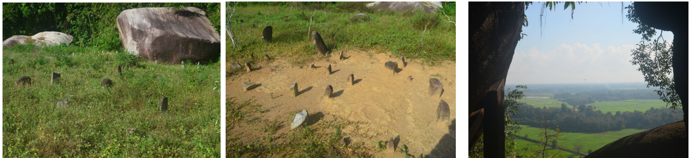
Figure 9: Former Footsteps and Sharpening Stone of Awang Selamat

There are also mystical components that serve as collective memory. For many locals, the term 'Puteri Saadong' evokes a component that is related to strength. In the esoteric market, there are sellers who sell a small clot of hair which is sometimes named after Puteri Saadong. Some people believe that it is a kind of shield that protects people against all types of 'dangers'. Even in the area of Bukit Marak there are mystical places. For example, a stone with a pond is believed have never dried out.