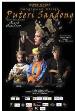
Figure 8: A Poster that promotes the Opera 'Puteri Saadong'.

Laman Puteri Saadong is a good example. It is an open space of a public university and it is named after the princess. In the unconscious level, the name of the legendary figure becomes familiar to the students and staff when they pass by this place which is in the centre of the campus in Bachok. Cultural events also play an important role in the evocation of memory. In Malaysia, there are theater performances, film productions or operas (see Figure 8).