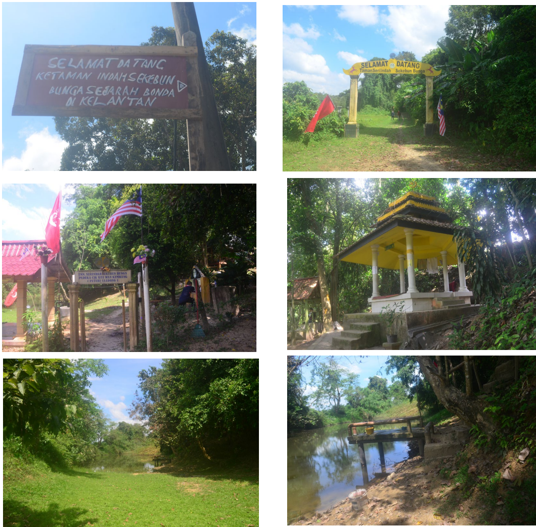
Figure 3: Taman Serendah Sekebun Bunga (a park beside the Kelantan river)

Other historical places in Kelantan that are related to Puteri Saadong are: