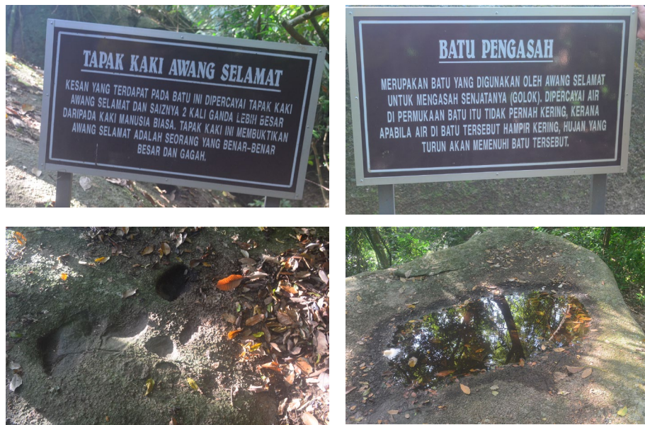
Figure 10: Former Footsteps and Sharpening Stone of Awang Selamat

At the top of Bukit Marak were found the former footprints of Awang Selamat, a bodyguard of Puteri Saadong, during her journey in Bukit Marak. Not far from the former site, Awang Selamat's former sword sharpener was found. The former place to sharpen the sword is often filled with water, and according to the beliefs of the local community, the water in the place is never dry, and if it wants to dry, it will rain.