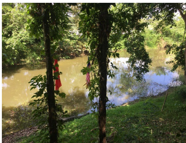
Figure 6: The Pond in Taman Serendah Sekebun Bunga