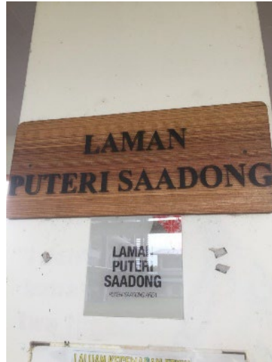
Figure 8: Laman Puteri Saadong

The story of Puteri Saadong is well-known to many Malaysians. Certain constructions and cultural events 'refresh' the memory both in a conscious and unconscious level. Many buildings and places are named after the princess, for example, the primary school just at the foot of Bukit Marak. Another example is placed in public buildings like the Laman Puteri Saadong at Universiti Malaysia Kelantan (see Plate 8), a recreational place for the students.