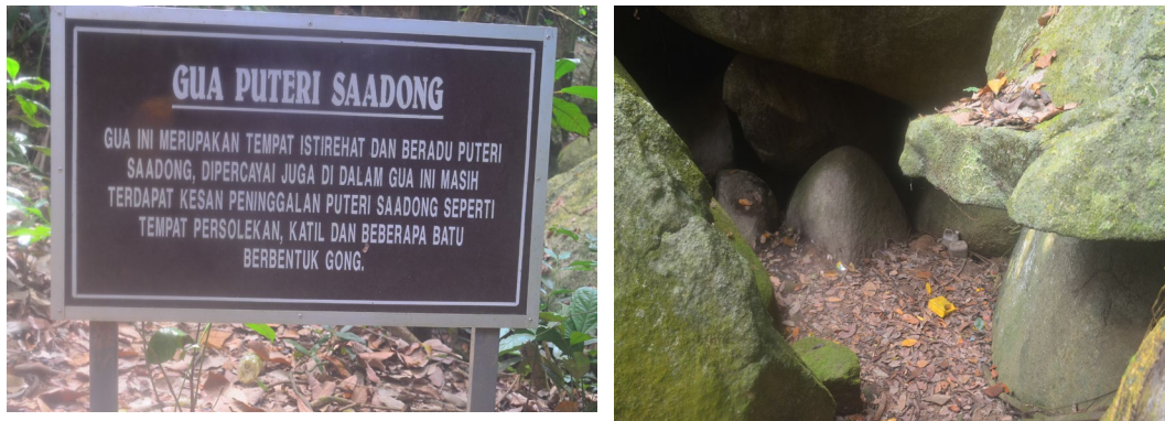
Figure 12: Puteri Saadong Cave in Bukit Marak

In Bukit Marak, a former cave was also found, which is believed to have been the residence of Puteri Saadong while she was in Bukit Marak. In ancient times, this place was believed to be where the community around Bukit Marak contacted or sought help from Puteri Saadong.