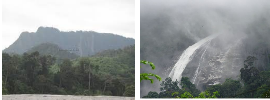
Figure 4: Gunung Ayam (a mountain in the interior of Kelantan).

Gunung Ayam, formerly known as Gunung Chinta Wangsa, was believed to be the centre of Her Majesty Cik Siti Wan Kembang's rule when she ruled Kelantan. The people also believe Gunung Ayam of Kelantan to be the last stop of Puteri Saadong with her followers before disappearing. However, it can be assumed that Puteri Saadong and the cultural memory about her are also influential in areas which are not directly connected to geological formations. Therefore, the research team also visited other places in Kelantan.