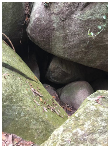
Figure 7: Entrance to the Cave of Puteri Saadong (Photo A. Stark, 2019)

Water is also essential in the daily life of a Muslim. One of the preconditions for the acceptance of the five daily prayers is cleanliness. Therefore, the believers must perform ablution (with water) before praying. A child is considered pure and without sins, thus it is probably no coincidence that the child Puteri Saadong is connected to the pure element of water. Other famous geological formations are related to events that took place after Puteri Saadong returned from Siam and after she stabbed her husband. She fled into the forest of Bukit Marak and lived there with her followers. One important geological place is the cave at the top of the hill (see Plate 7).