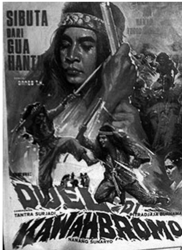
Fig.3 Comic Cover “Si Buta dari Goa Hantu”