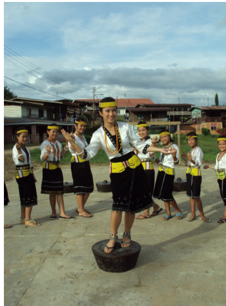
Figure 7: Sekafi Dance with Female Dancer Dancing on Gong .