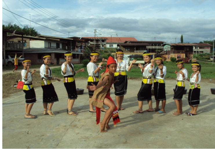
Figure 4: Female and Male Dancers in Gong Dance

Gong dance is the original traditional dance from Lundayeh ancestors. Gongs are able to produce loud, resonating and powerful sounds that uproar the warrior spirits, joy and strength of the people. In addition, the sounds of gongs can travel far and make effective announcements to the whole village and other villages of any festive occasions held in a village. These were part of the reasons why Lundayeh used gongs as the main music instruments for their dances in the ancient time. Today, traditional gong dance can only be found in Kampung Sugiang Baru and Kampung Kalibatang Baru, Kemabong (Padan, 2012).