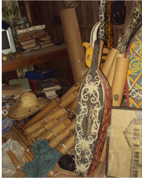
Figure 8: Sekafi Musical Instrument Used to Accompany Sekafi Dance

Sekafi dances are adopted from subgroups of Dayak Kenyan and Dayak Iban in Kalimantan. It is usually accompanied by one to two sekafis . While sekafi improvises and varies in its musical rhythms, melodies and patterns among three surviving sekafi dances: sekafi tangan , sekafi lilin and sekafi parang , the dance movements of the three dances remain almost the same (Iping, 2012).