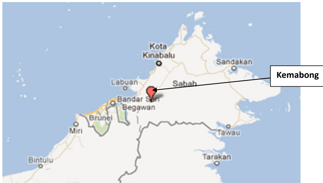
Figure 2 : Location of Kemabong in Sabah. ( http://www.worldplaces.net ).

Crossing the high beautiful hills and magnificent mountains along the southwest coast of Sabah for more than 3 hours or 163 kilometres in distance from Kota Kinabalu, we finally reached Tenom, the prominent town 31 kilometres away from Kemabong. Kemabong was our actual destination, where Lundayeh villages can be found. There are three major Lundayeh villages in Kemabong: Kampung Kalibatang Baru, Kampung Baru Jumpa and Kampung Sugiang Baru. Kampung Baru Jumpa consists of four small villages: Kampung Jumpa Ulu, Kampung Jumpa Tengah, Kampung Jumpa Seberang and Kampung Belumbung. There are other smaller Lundayeh villages nearby such as Kampung Meluyan Lulu (Sakai, 2012).