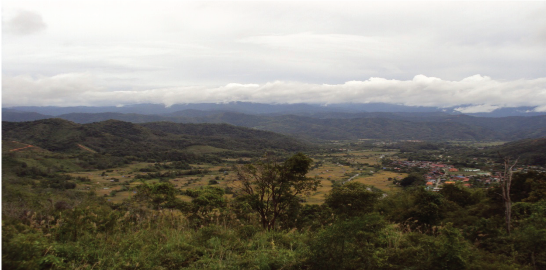
Figure : Mountain Sights and Landscapes in Kemabong and Tenom.