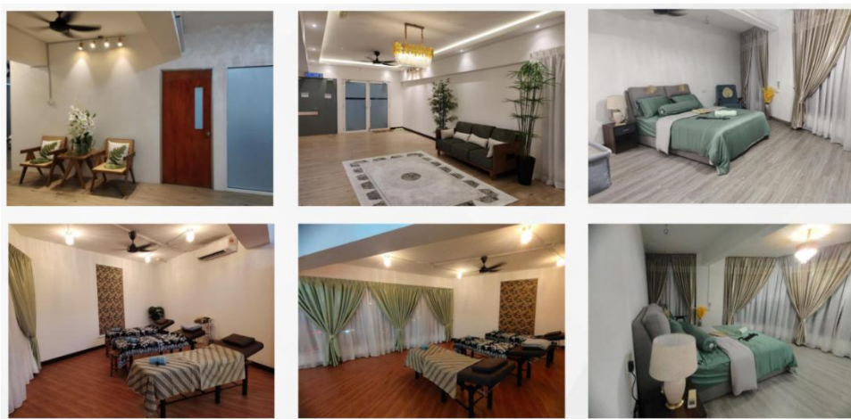
Figure 1: Purut Therapy Centre

What sets Purut Therapy Centre apart is its identity as a community-driven enterprise, rooted in Islamic principles of wellness, modesty, and empowerment. Unlike typical confinement centres that operate purely for profit, Purut Therapy is designed to nurture both its clients and its workforce, functioning as a hybrid model of wellness and social entrepreneurship.